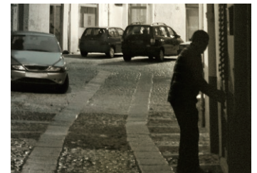
AG Neovo RX-Series